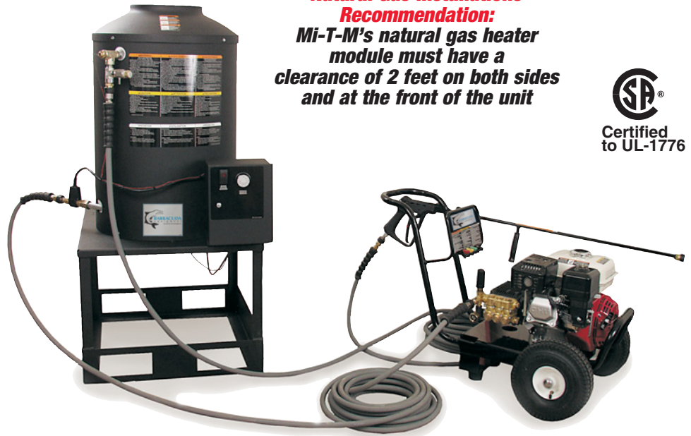
HGM-3506-0E10 shown with JP-2703-0MHB