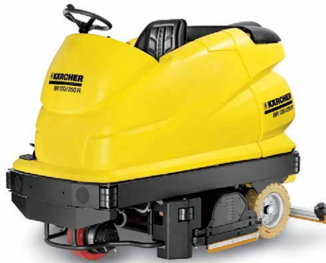
BR 100/250 R