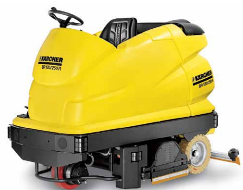
BR 120/250 R