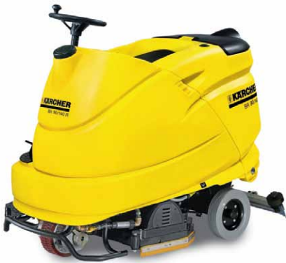
BR 90/140 R

Optional Accessories: Lead Acid or AGM Battery Packs Heavy Duty Grit Cleaning Brush Extra Stiff Heavy Duty Grit Cleaning Brush Hi-Lo Pile Clean Brush - for grout Soft Scrub Brush - for sensitive surfaces Cab Roof Overhead Guard Rotating Pole Mounted Beacon Light Work Light - for dim or poorly lit areas Solution Recycling Kit