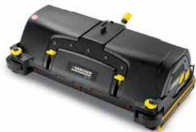
Brush heads R 75 / R 90

■ Included in delivery. Optional. 1) 330 Ah, low-maintenance. 2) 360 Ah, low-maintenance. 3) 312 Ah AGM low-maintenance.