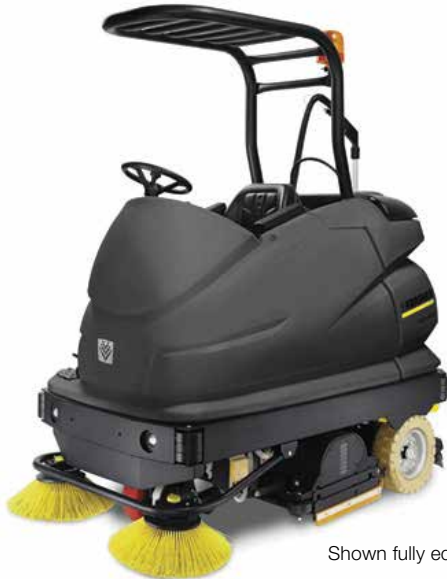
Shown fully equipped