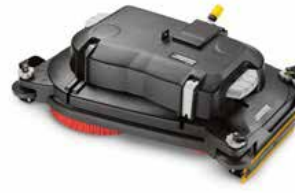
Brush heads D 75 / D 90