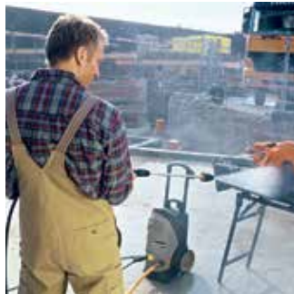
Automatic pressure cut-off