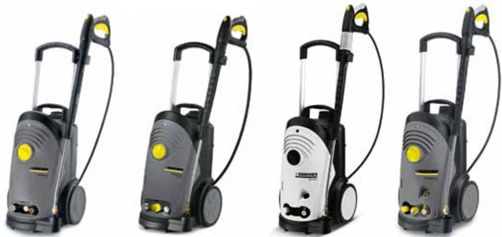
HD 1.8/13 C Ed*

Kärcher's Classic Series electric powered cold water units are compact, highly mobile and hard wearing. Built with high grade lightweight polypropylene and designed with usability and ergonomics in mind, these units feature patented direct drive Kärcher axial pumps with corrosion-resistant brass cylinder heads and protected by a 5-year warranty. They can deliver up to 4.5 GPM at 3200 PSI and are ETL certified to UL and CSA standards.