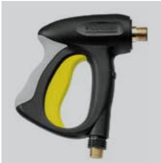
Easy press trigger gun