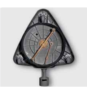
Cleaning power that doesn't leave a trace.

The FRV 30 has an additional jet nozzle that generates a suction effect that moves dirty water into the drain hose and away from the clean surface. This is an enormous advantage – not only for interior cleaning but also for saving time and allowing the surfaces to be cleaned and ready for use again.