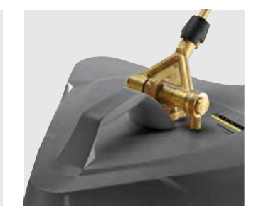
Handle for wall cleaning.

Three steering rollers provide the FRV 30 with excellent maneuverability on all surfaces. They are efficient and virtually unnoticeable, leaving no track marks behind at all.