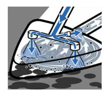
Integrated direct suction function.

All Kärcher hard-surface cleaners have robust and powerful technology and standardised connections and adapters that enable them to be easily connected with Kärcher HD/HDS high-pressure cleaners and with HD guns. The right hard-surface cleaner for every single task.