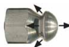
1-forward, 3 back ports