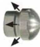
0-forward, 3 back ports