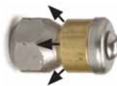
0-forward, 3 back ports

*Duct Cleaner jet to sides instead of reverse