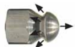
1-forward, 4 back ports