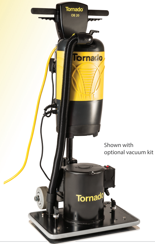
Shown with optional vacuum kit