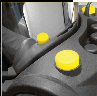
EASY ACTIVATION – Large, easy to access on/off switch