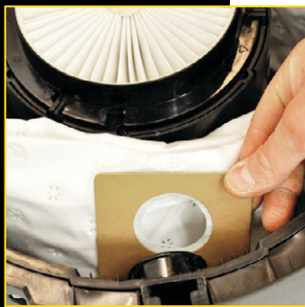
MAXIMUM POWER FILTRATION – Includes three layer fleece filter bag, permanent main filter, and motor protection filter, and HEPA exhaust filter